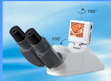
Swivel Head LCD